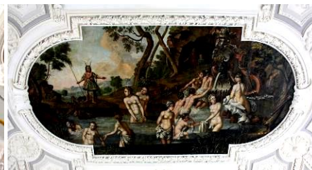
Overnight in Tallinn